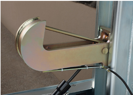
Truck presence bar.