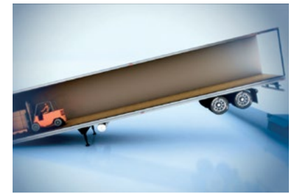
Trailer up-ending (nose drop)

The wide top plate and twin vertical supports will absorb momentum caused from landing gear collapse and help to minimize the trailer nose from rolling or dropping.