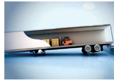
Trailer tip-over (nose roll)

Stabilize the nose of trailers to minimize loading dock accidents when loading and unloading spotted trailers.