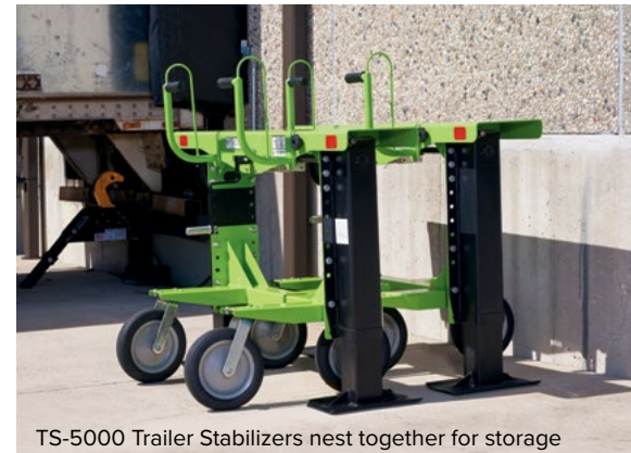
TS-5000 Trailer Stabilizers nest together for storage