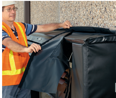
Removable light-blocking head curtain.

Light-blocking head curtain face helps prevent trailer protrusions from breaking the seal at the top of the trailer. Gaps of light are minimized, meaning less intrusion of water and contaminants, reduced energy loss, and help with passing inspections.