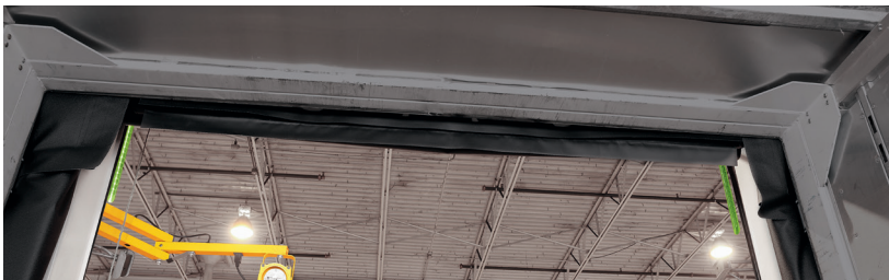
High performance head curtain features layers of light-blocking pleats to effectively seal these trailer protrusion gaps. (View from inside trailer.)