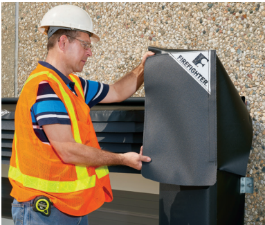
Removable, replaceable corner wear boots.