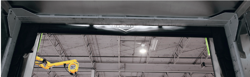
Ordinary head curtains leave gaps around trailer protrusions. (View from inside trailer.)