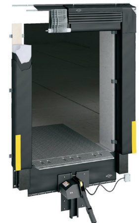
Performer™ Dock Seal