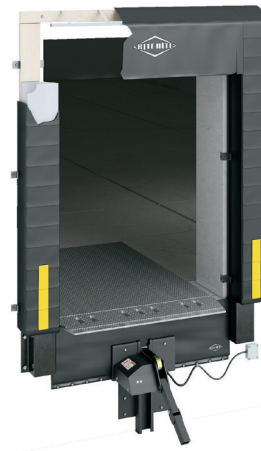
Classic Dock Seal