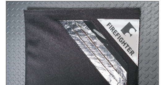
Protective Firefighter heat dissipation design is exclusive to Rite-Hite dock seals.

Classic Dock Seals are part of Rite-Hite's unique lineup of high quality foam compression seals, available in a variety of configurations for different sealing efficiency and long-term durability requirements. Ask your Rite-Hite Representative for more information.