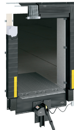
Classic Dock Seal with High Performance Header