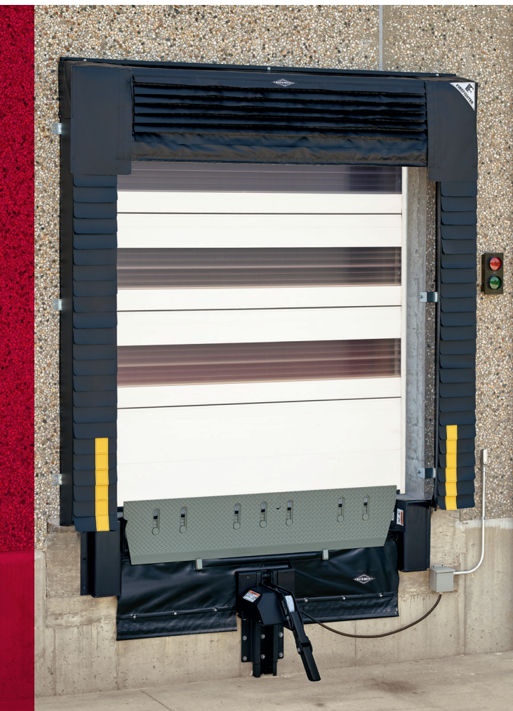
Unit shown with high performance head curtain, 4" vinyl ArmorPleat side pad protection and optional PitMaster 4th-side sealing system.