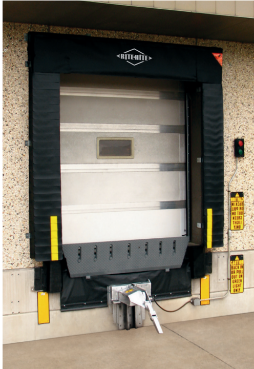
Unit shown with traditional head curtain, optional Firefighter protection, and 4" vinyl ArmorPleat™ side pad reinforcing.