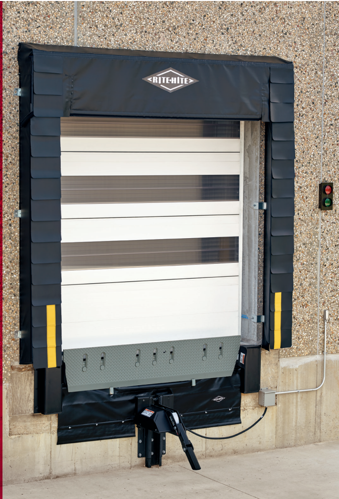
Unit shown with traditional head curtain, 8" vinyl ArmorPleat side pad protection, and optional PitMaster 4th-side sealing system.