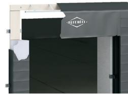
Classic Dock Seal

Classic Dock Seals are part of Rite-Hite's unique lineup of high quality foam compression seals, available in a variety of configurations for different sealing efficiency and long-term durability requirements. Ask your Rite-Hite Representative for more information.