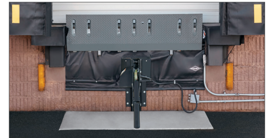
PitMaster Under-leveler Seal.

Gaps beneath and around dock leveler and bumpers are sealed with optional PitMaster components, providing energy savings, improving cleanliness and helping pass inspections.