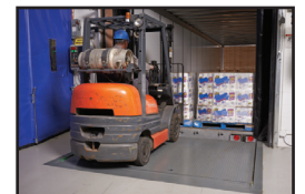
Full-width End-load Access