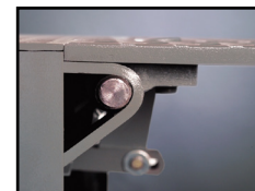
Two-point crown control