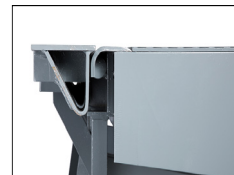
Constant radius rear hinge