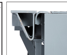
Constant radius rear hinge