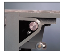
Two-point crown control