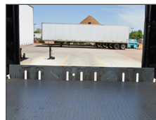
Rugged Steel Safe-T-Lip