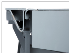
Constant radius rear hinge