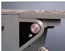
Two-point crown control