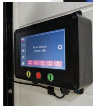
Graphic User Interface