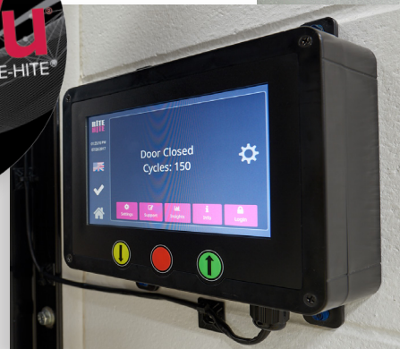
Graphic User Interface (GUI)