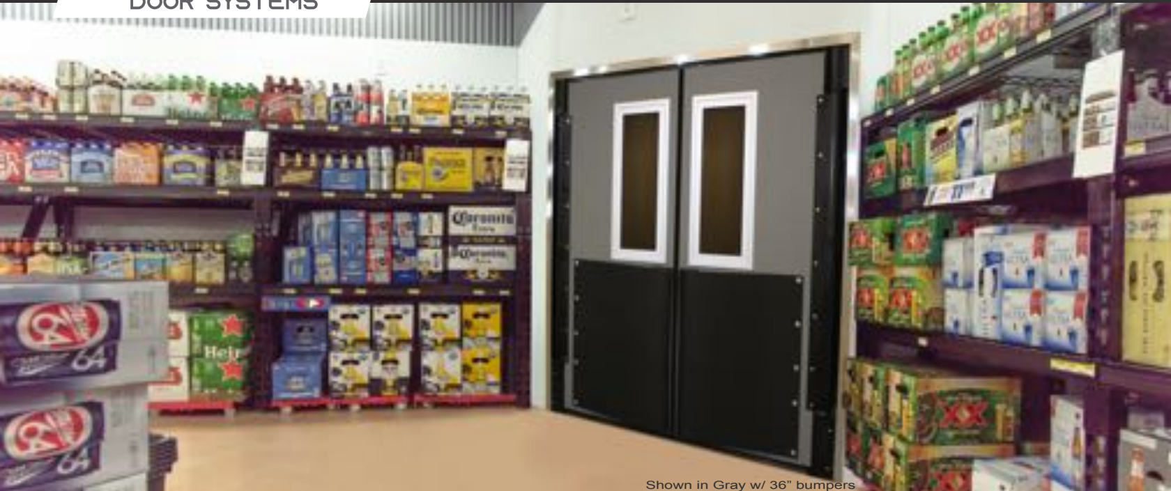
Shown in Gray w/ 36" bumpers

The Phoenix °C°F Insulated °Cooler °Freezer impact door is the only one on the market with a fiberglass spine and composite hinges, which provide a proper thermal break between temperature controlled environments.