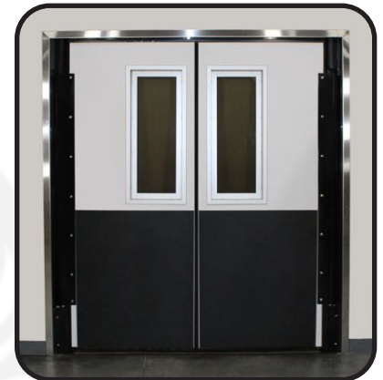
Shown in White w/ 36" kick plates