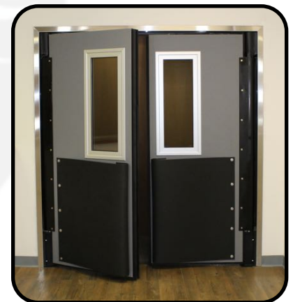
Shows dual blade gaskets on leading edge